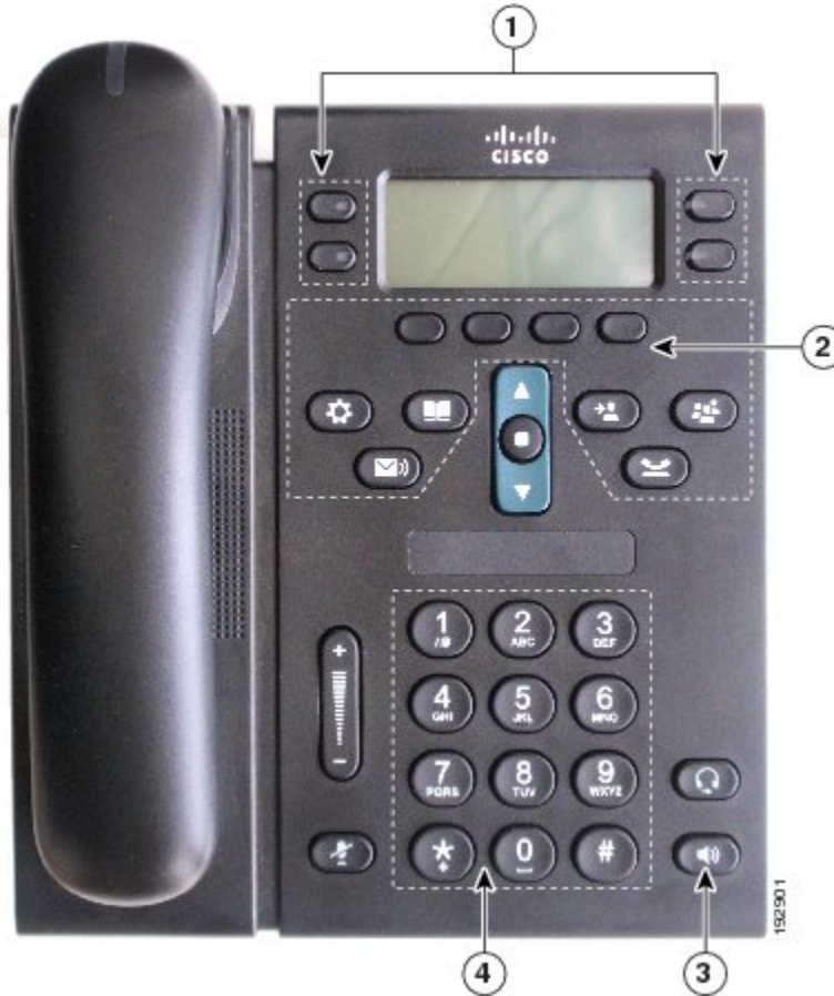
Figure 3: Mobility-Impaired Features—Cisco Unified IP Phone 6941 Shown

The following figure shows the features that are supported on the Cisco Unified IP Phones 6921, 6941, 6945, and 6961, except where exceptions are noted. The features shown in the figure are described in the following table.