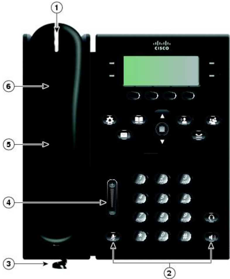
Table 1: Hearing-Impaired Features