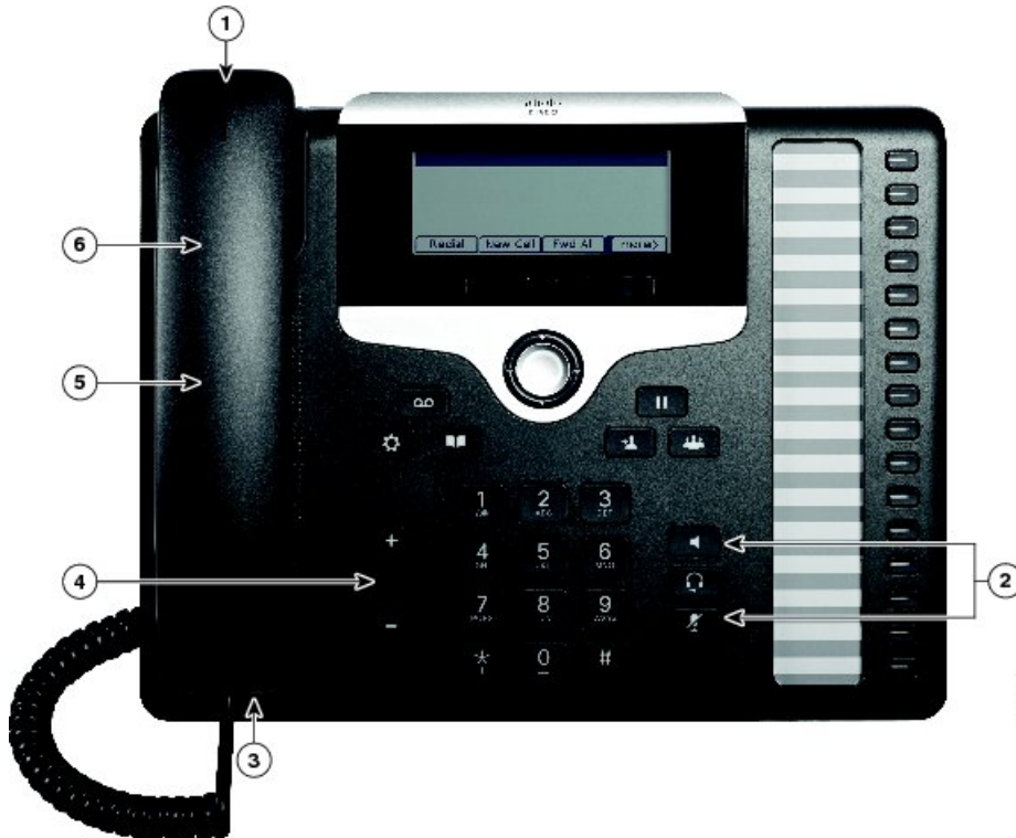
Table 1: Hearing-Impaired Accessibility Features