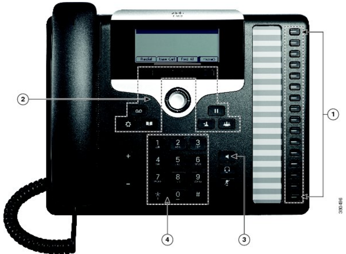
Figure 3: Mobility-Impaired Accessibility Features—Cisco IP Phone 7861 Shown

Your phone comes with standard accessibility features that require little or no setup.