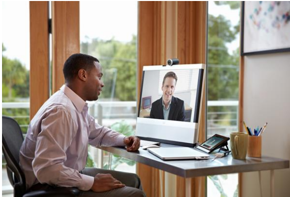
Figure 1. Cisco TelePresence EX90 in Home Office