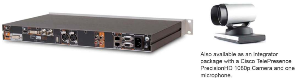
Figure 1. Cisco TelePresence Codec C40

The Cisco TelePresence® portfolio creates an immersive, in-person experience over the network—empowering you to collaborate with others like never before. Through a powerful combination of technologies and design that allows you and remote participants to feel as if you are all in the same room, the Cisco TelePresence portfolio has the potential to provide great productivity benefits and transform your business. Many organizations are already using it to manage costs, make decisions faster, improve customer intimacy, scale scarce resources, and speed products to market (Figure 1).