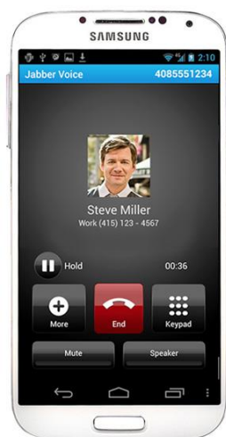
Figure 1. Cisco Jabber Voice for Android

Cisco Jabber Voice for Android is also one of the many Cisco Jabber clients providing unified communications on various platforms and devices. The Cisco Jabber Voice solution is one of several Cisco solutions for Android devices, such as Cisco WebEx® Meetings .