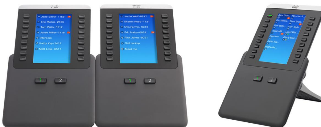
Figure 1. Cisco IP Phone 8800 Key Expansion Module

Quickly adapt to market changes. Increase productivity. Improve competitive advantage through speed and innovation. And deliver a rich-media experience across any workspace securely and with the best possible quality. Cisco® Unified Communications Solutions enable the collaboration that makes this possible (Figure 1).