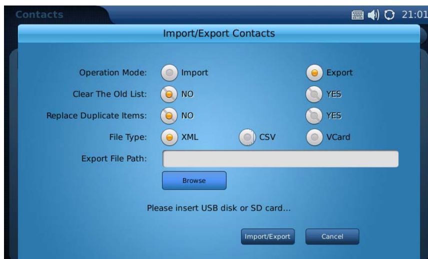
Figure 7: Export Phonebook via Touch Screen