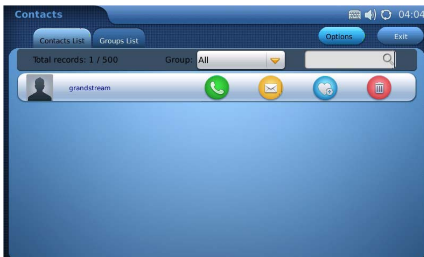
Figure 1: MENU->CONTACTS->Options->Download

After pressing “Download”, the screen will display the download settings as can be seen in Figure 2.