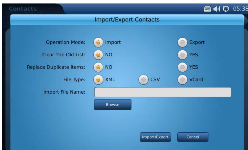
Figure 6: Import/Export Phonebook on GXV3175

When using phone's touch screen to import/export phonebook, users need to insert SD card or USB flash drive first. Then access the phonebook application by selecting MENU-> Contacts in the main screen. (See Figure 1) Press the "Options" button and select "Import/Export" in the dropdown list. Then the screen will show as Figure 6.