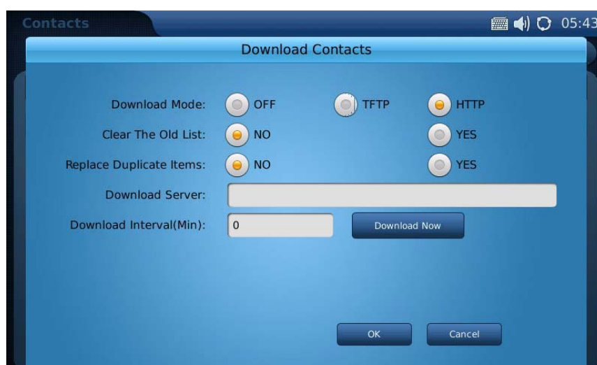
Figure 2: Download Settings via touch screen

After pressing “Download”, the screen will display the download settings as can be seen in Figure 2.