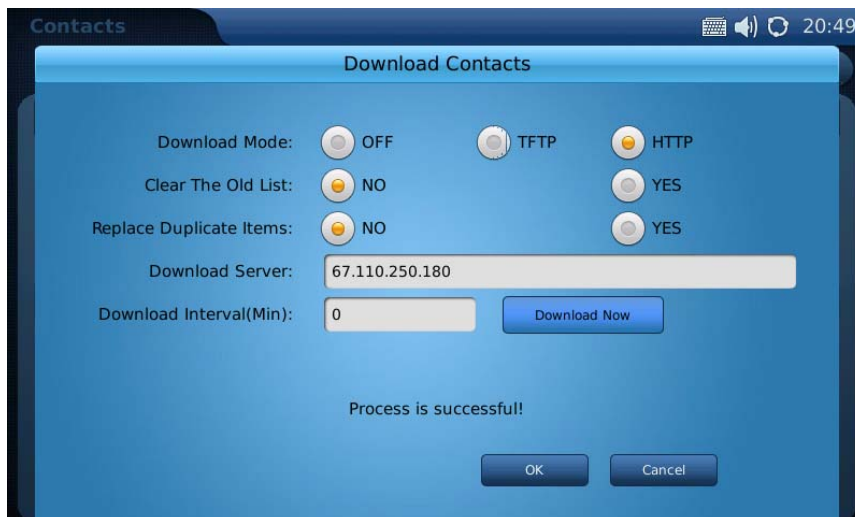
Figure 3: Phonebook.xml Download Successful

GXV3175 will start downloading the XML Phonebook and display the download status message on the phone's LCD screen. If the download is successful, the message "Process is successful!" will be displayed on the bottom of the screen. See Figure 3.